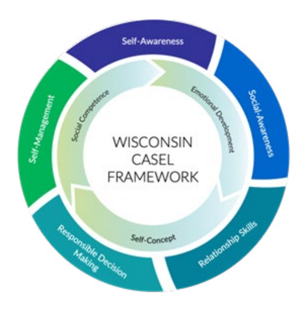
Figure 2. Wisconsin-CASEL Aligned Framework

The three domains of the Wisconsin model ( Figure 2 ) (i.e., emotional development, self-concept, social competence) provide the conceptual framework for the PreK-adult competencies. The five CASEL core competencies of self-management, self-awareness, social awareness, decision-making, and relationship skills (as seen in Figure 1) are all contained within these three domains.