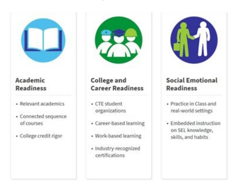
Figure 3. ACP Process for Career Readiness